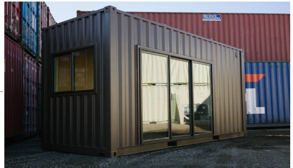
Sample Office Rendering